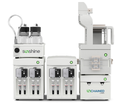
Figure 1: Sunshine: Formulation optimization and scale-up.

The immune synapse governs essential cell fate decisions that dictate a range of adaptive immune responses. Understanding and manipulating the tightly controlled biological signals within this synapse is essential for enabling the development of novel therapies that can reprogram immune cells. Until recently, advances in this field have been grounded primarily in protein engineering, but pioneering researchers are now starting to explore the potential of materials science to accelerate the development of novel immunomodulatory nanomedicines.