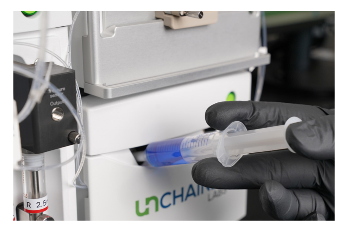
Figure 3: Loading the sample loops with reagent ahead of running an automated set of experiments.

"I'm fascinated with how nanotechnology can be integrated into larger macroscopic biomaterials, and I'm interested in characterizing how these materials interact with immune cells within the body. I was drawn to the idea of an easy-to-use, automated microfluidics system that would streamline both PNP and LNP development, even when working at a smaller scale. We also wanted to be able to set up a queue of different LNP formulation experiments, helping us to rapidly fine tune our product through LNP optimization. I discussed my lab's specific research needs and practical limitations extensively with Unchained Labs, and we compared the company's offerings with platforms from alternative providers. These detailed conversations quickly convinced me that <u>Sunshine</u> was the right choice for my group."